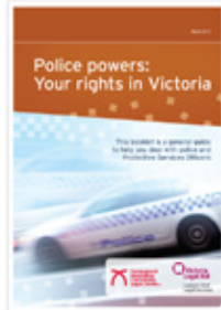
Police powers: your rights in Victoria

Open Monday to Friday, 9 am to 5 pm 350 Queen Street, Melbourne