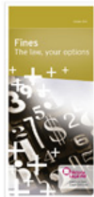
Fines: the law, your options